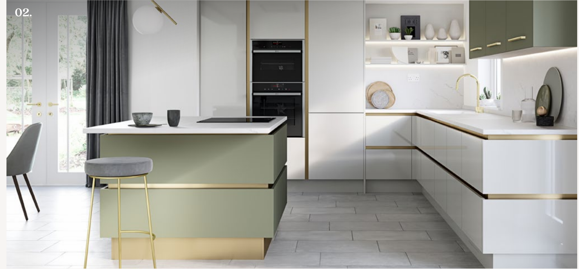
O2. Synergy Handleless in Gloss Dove Grey and the island unit is in Regiment with a Marina Quartz worktop.