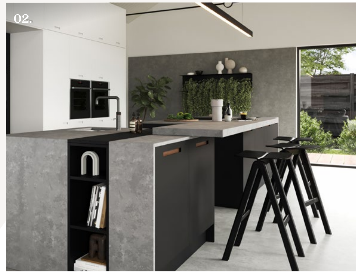
O2. A Modern Slab kitchen in Carbon for the island and White for the floorto-ceiling cupboards.

03. Modern Slab kitchen in White Gloss with a matching Laminate worktop for a clean finish.