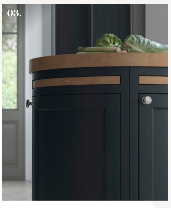
03. Quadrant barrel unit with solid Oak inset trays and circular timber top.